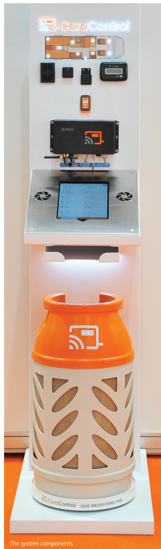
The system components